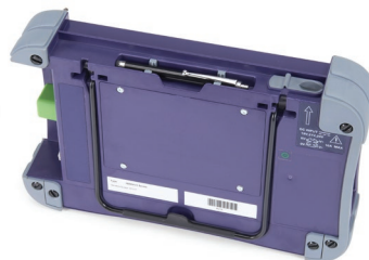
E6100 fiber module carrier