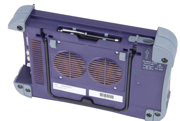
E6300 transport and fiber module carrier