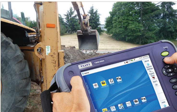
Portable and upgradeable platform with interchangeable test modules increases technician productivity

The flexibility of interchangeable module carriers and various plug-in modules let users create a platform that meets today's specific testing needs and yet it can evolve seamlessly to meet tomorrow's ever-changing network requirements.