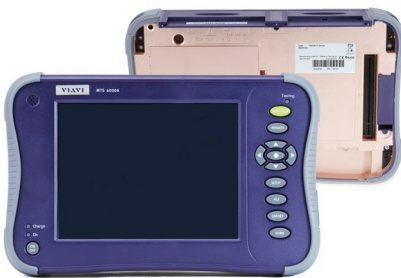
Back of the module carrier where other modules are attached

The multidimensional design of the T-BERD/MTS-6000A (V2) provides optimal configuration flexibility with extended battery life. The E6100 module carrier is best suited for fiber applications; whereas, the high-powered battery in the E6200 module carrier extends battery life when used with the carrier Ethernet (MSAM) or other intensive fiber applications.